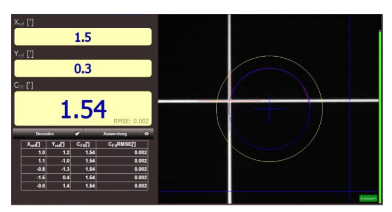
Fig.: Centering measurement with tolerance field circle