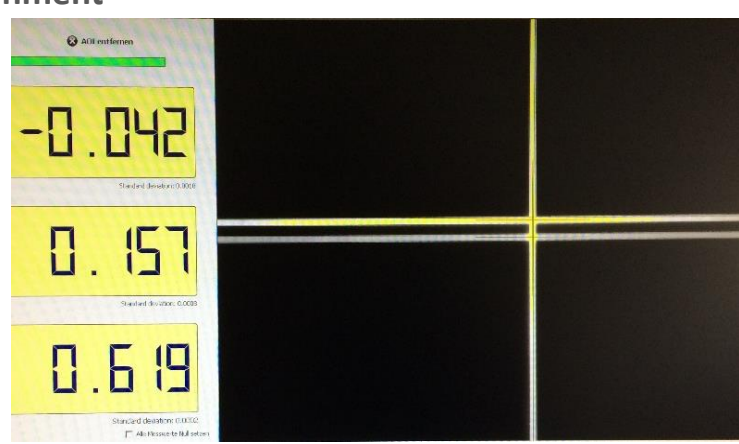
Fig.: Application of wedge angle measurement via double cross

The subpixel accurate measured values can be retrieved on demand in real time, saved in tables and exported as a csv file. An external trigger input facilitates synchronization with the customer's processes.